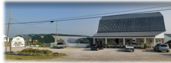
Bench Family Farms